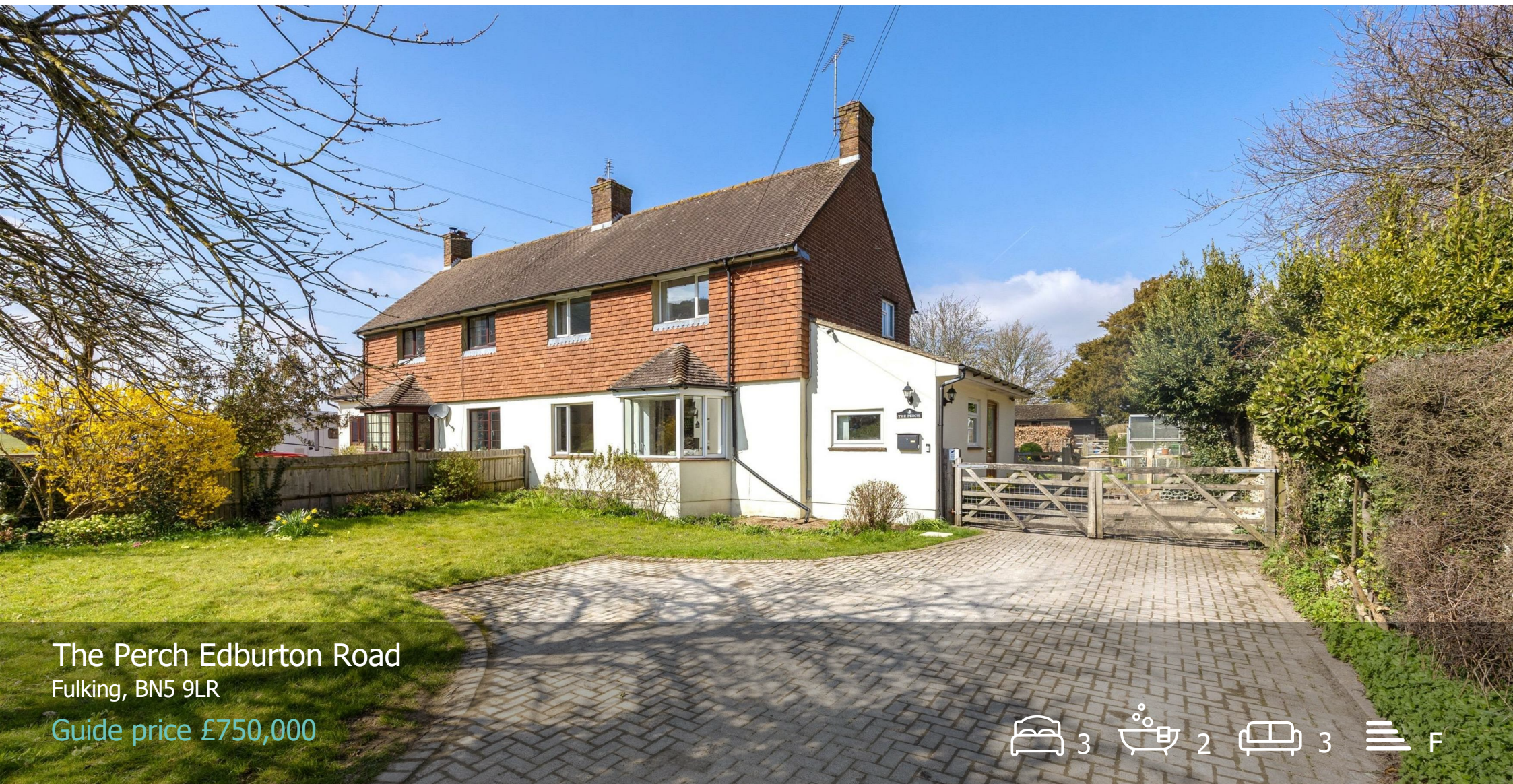
The Perch Edburton Road